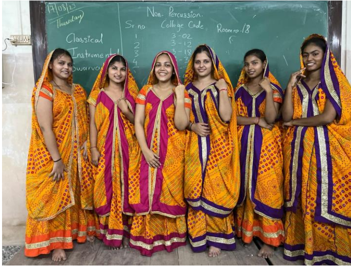
Participants of Hindi Skit – ‘Bedia’