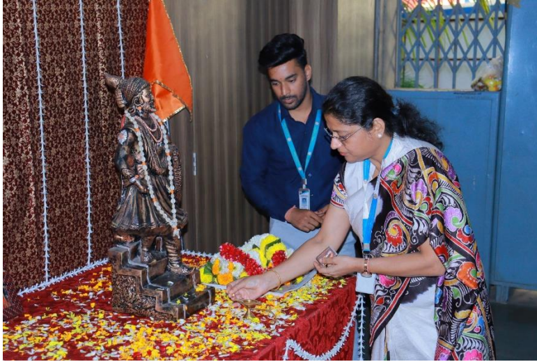
Principal Madam lighting the lamp at Shivjayanti Celebration.