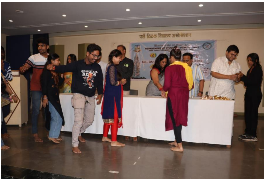
Silver Medal for Hindi Skit at Youth Festival of the University of Mumbai