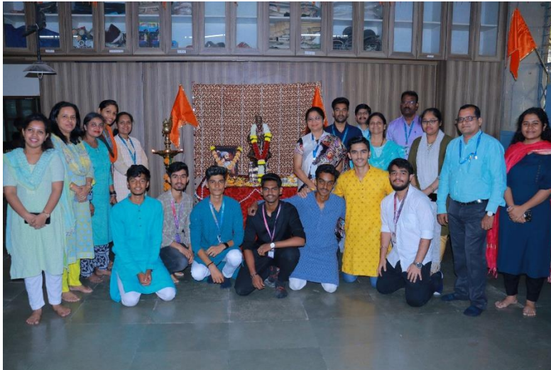
Principal, Teaching, Non-teaching staff, and students at Shivjayanti Celebration.