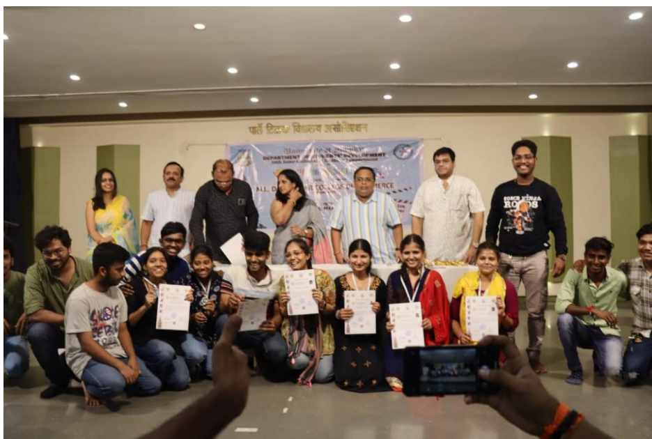
Winners and Directors of Hindi Skit at Youth Festival of the University of Mumbai