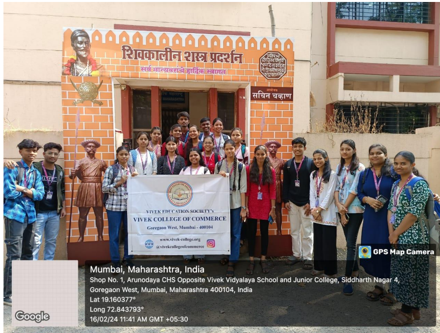
Students at Shivkalin Shastra Pradarshan